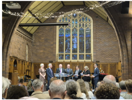
Induction Service - Tue 20th Jan 2026