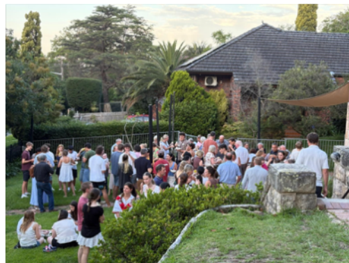
Welcome Supper after 6pm