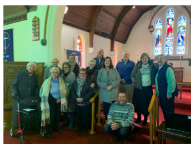
Parish of Blayney