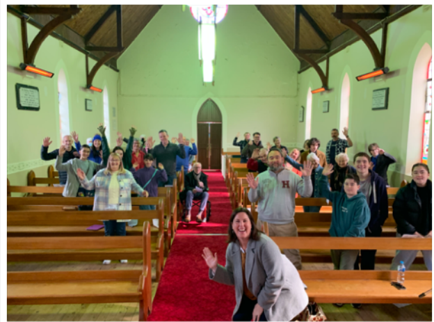
Parish of Millthorpe