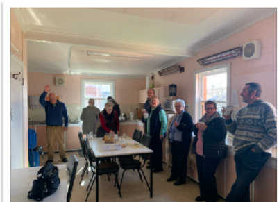
Morning tea at Blayney