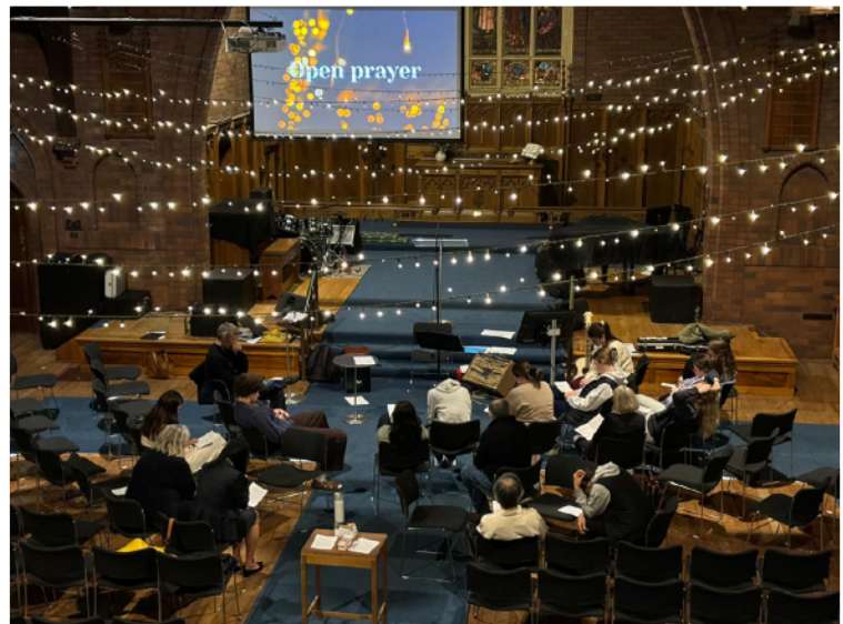
Church-wide prayer and praise night