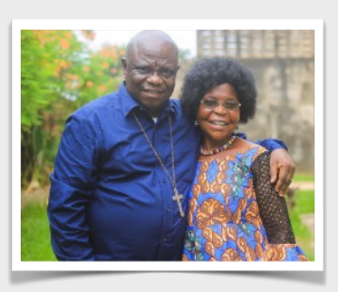
DRC - Archbishop Masimango